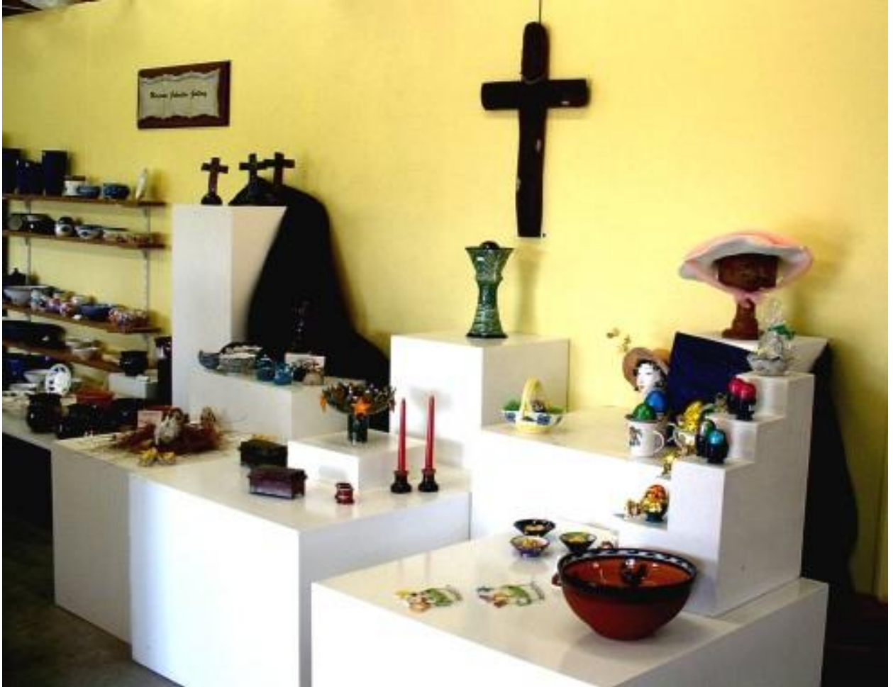
Our Easter display