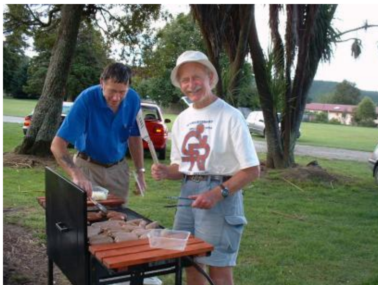
"Mans Work" Picnic Faulkner's Bush 2002