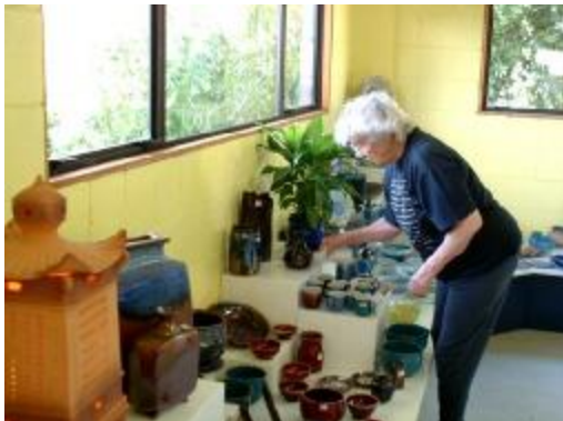
Keep that duster going

As no one has come forward regarding the exhibition this year, a decision has been made to have an exhibition in 2003. A Convenor has still to be appointed and suggestions or volunteers are requested for the post. There is agreement in the committee that the exhibition should have another format.