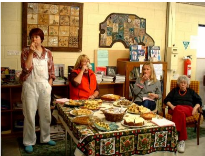
Craft Potters members indulging in their second most favourite pastime